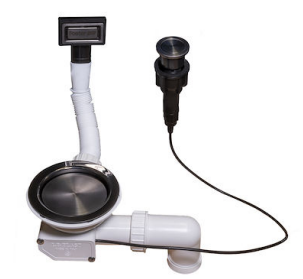
Space Push Gun Metal automatic waste fitting - PO