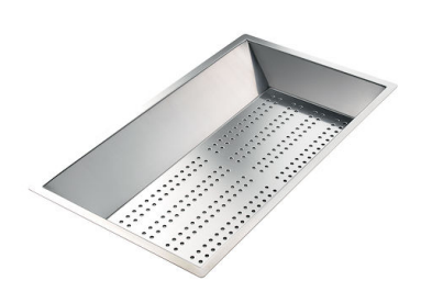
Stainless steel perforated tray