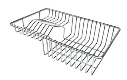
8100 303 * only in combination with the accessory 8644 101